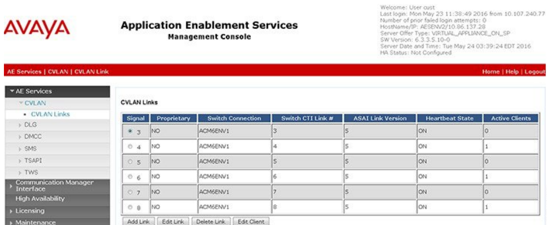
Figure 1: CVLAN Link Setup Screen