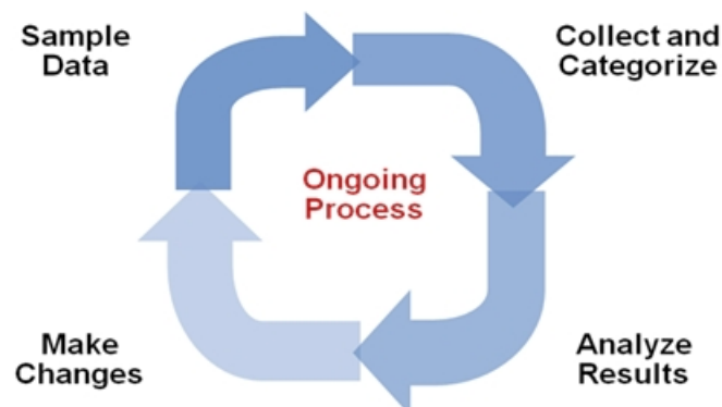
Figure 1: Capacity Planning Process

Change an existing Unified ICM/Unified CCE deployment in small steps. Then analyze the impact of each step with a well-established, repeatable process. This process includes the following phases (steps):