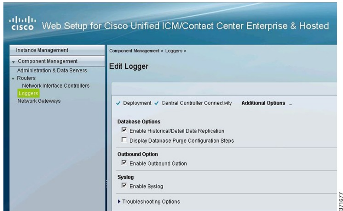
Figure 1: Enable Syslog

These steps runs the CW2KFEED process when the logger is started.