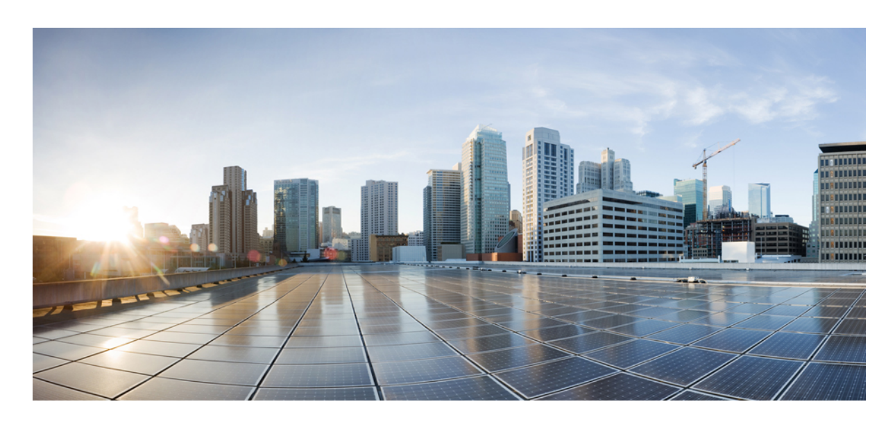
Database Setup Guide for the IM and Presence Service, Release 15