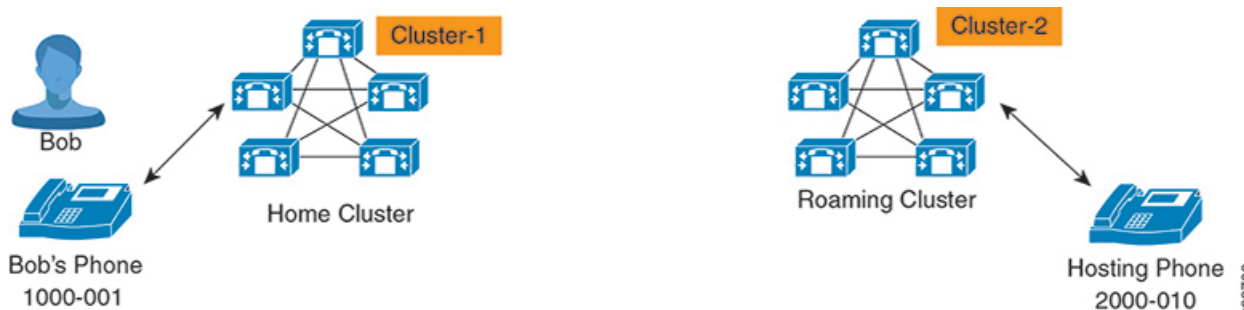
Figure 1: Home Cluster vs. Roaming Cluster

The following figure depicts the home cluster versus a roaming cluster in Extension Mobility Roaming across Cluster.