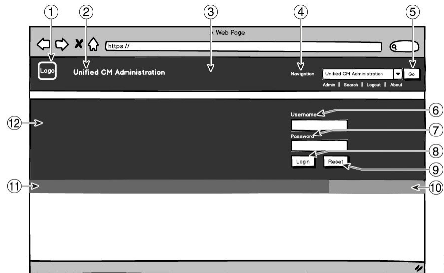
Figure 1: Branding Options for Unified CM Administration Login Screen

The following images display the customization options for the Cisco Unified CM Administration user interface: