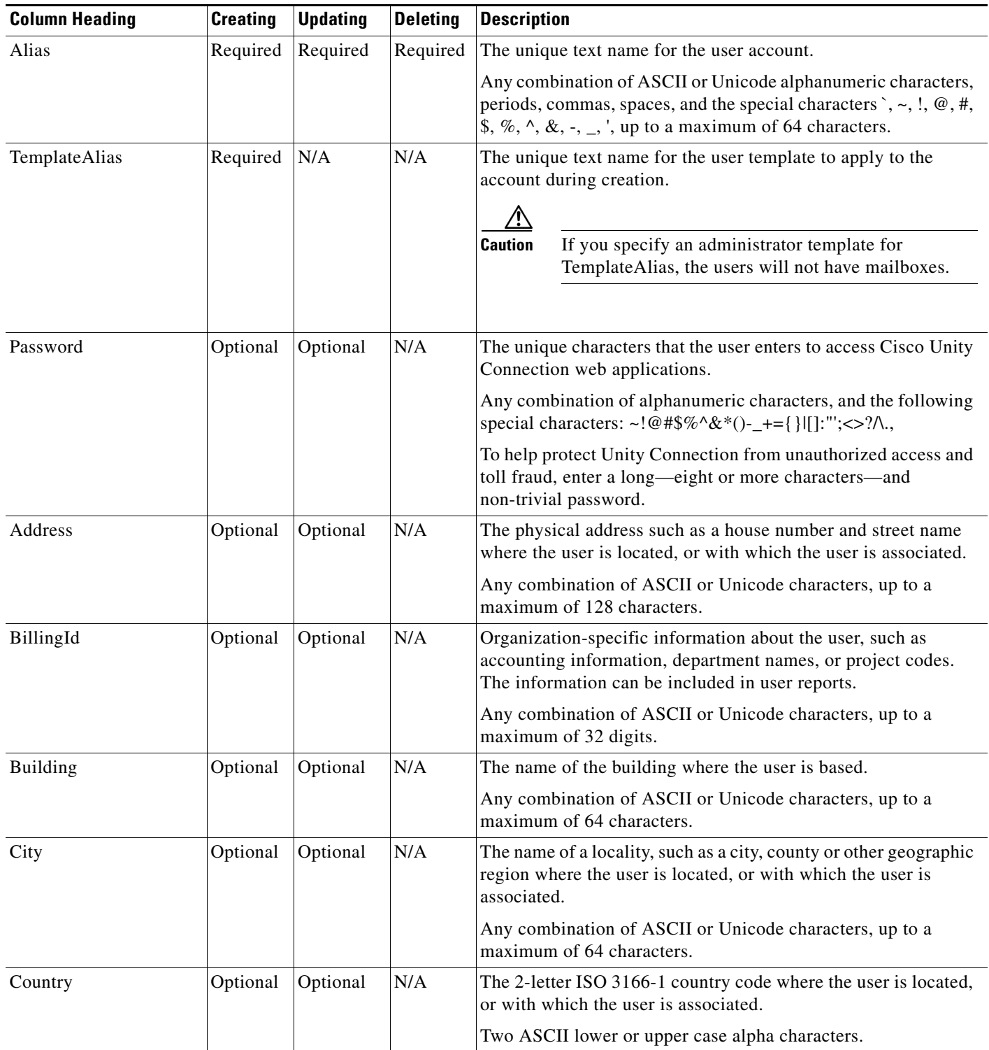
Table A-1 Required and Optional CSV Fields for Users Without Voice Mailboxes