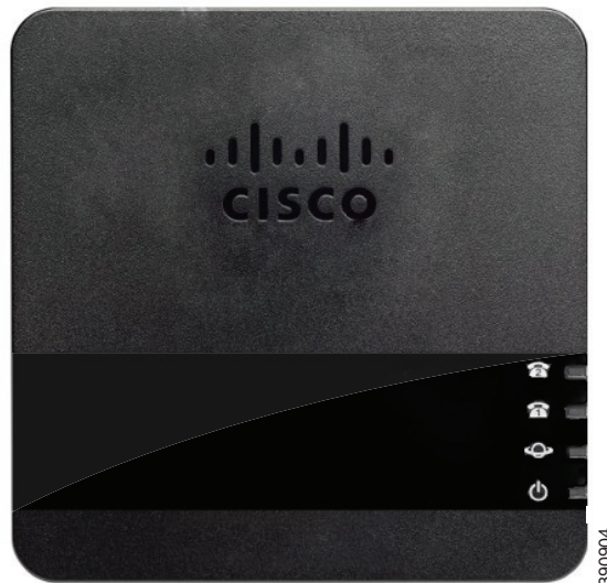
Figure 1-1 Cisco Analog Telephone Adapter