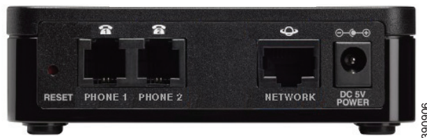
Figure 1-3 ATA 190—Rear View

The ATA 190 is a compact, easy to install device. Figure 1-3 shows the rear panel of the ATA 190.