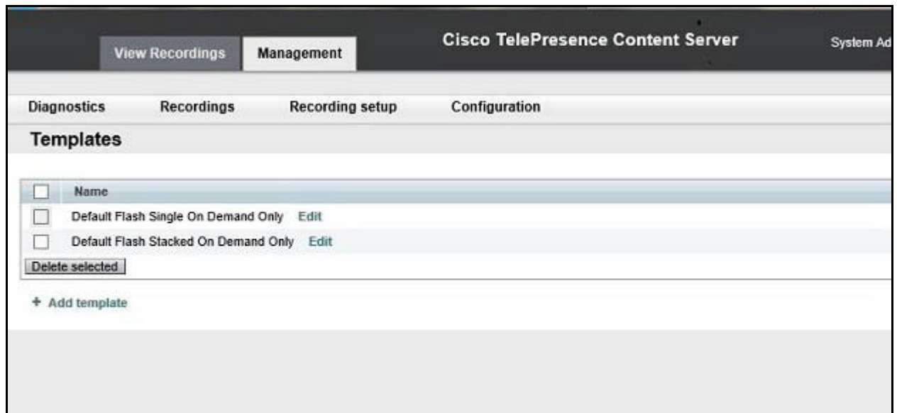
Figure 4-5 Add Template