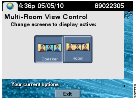
Figure 3-4 View Control

To change the way you view participants during a Cisco TelePresence conference, follow these steps: