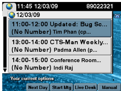
Figure 3-1 Meetings Screen

Table 3-1 shows available Meetings Screen buttons and softkeys.