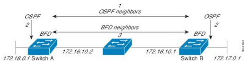
Figure 1: BFD Process on a Network Configured with OSPF

The figure below shows what happens when a failure occurs in the network (1). The BFD neighbor session with the OSPF neighbor device is torn down (2). BFD notifies the local OSPF process that the BFD neighbor is no longer reachable (3). The local OSPF process tears down the OSPF neighbor relationship (4). If an alternative path is available, the devices immediately start converging on it.