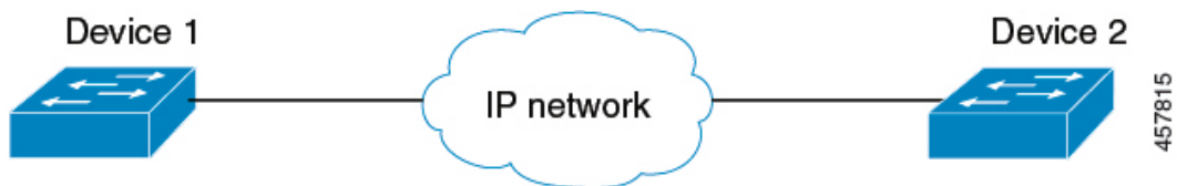
Figure 3: Example for Generalized PTP over Layer 3 Unicast

The following example shows how to configure generalized PTP over Layer 3 unicast on Device 1: