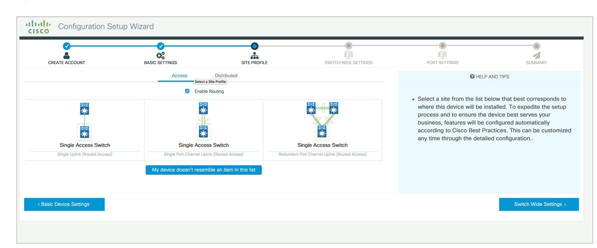
Figure 13: Site Profile - Access Switches (with Routed Access)