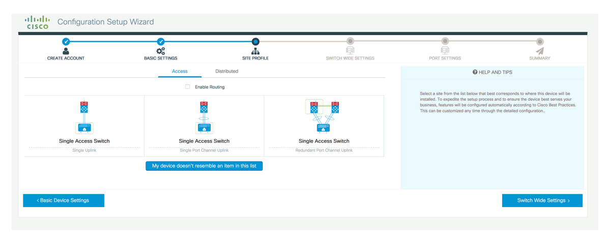
Figure 12: Site Profile - Access Switches