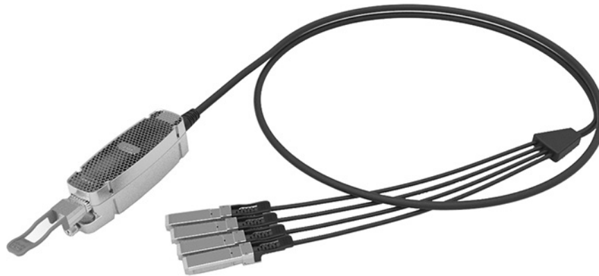
Figure 10-2 Cisco CVR-4SFP10G-QSFP Adapter with QSFP+ Module Plugged In