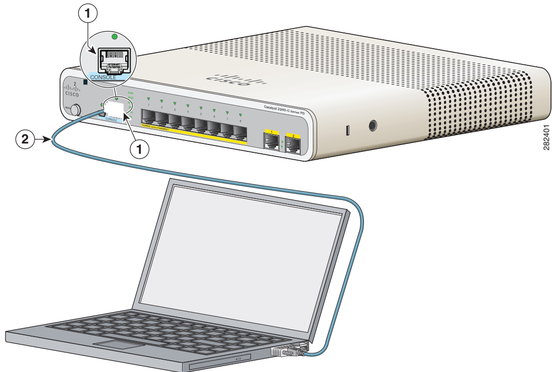
Figure C-1 Connecting the Console Cable