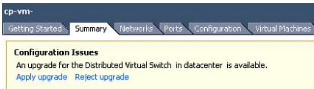
Figure 3: vSphere Client DVS Summary Tab

Step 2 Click the vSphere Client DVS Summary tab to check for the availability of a software upgrade.