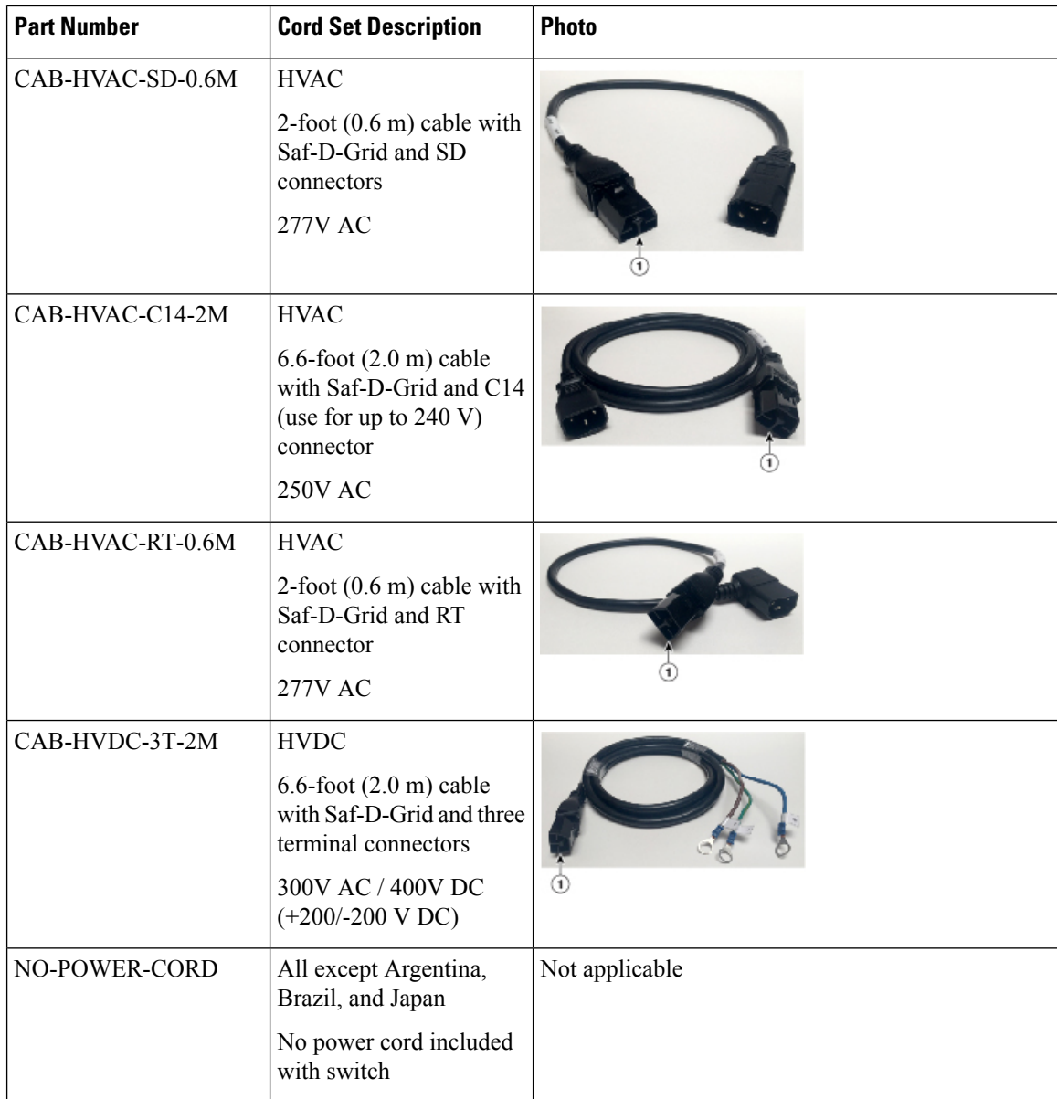
Table 1: HVAC/HVDC Power Cables Callout Table