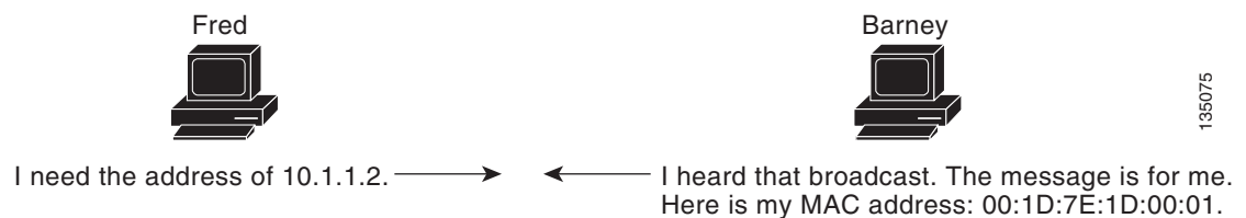
Figure 2-1 ARP Process

When the destination switch lies on a remote network which is beyond another switch, the process is the same except that the switch that sends the data sends an ARP request for the MAC address of the default gateway. After the address is resolved and the default gateway receives the packet, the default gateway broadcasts the destination IP address over the networks connected to it. The switch on the destination network uses ARP to obtain the MAC address of the destination switch and delivers the packet. ARP is enabled by default.