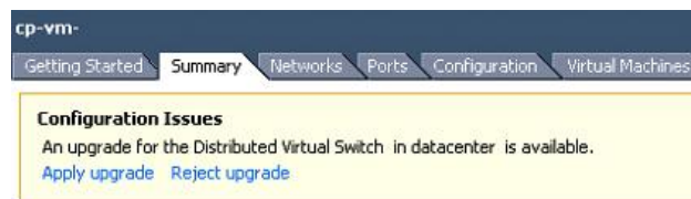
Figure 3: vSphere Client DVS Summary Tab

Step 2 Click the vSphere Client DVS Summary tab to check for the availability of a software upgrade.