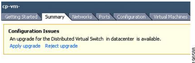
Figure 3: vSphere Client DVS Summary Tab

Step 2 Click the vSphere Client DVS Summary tab to check for the availability of a software upgrade.