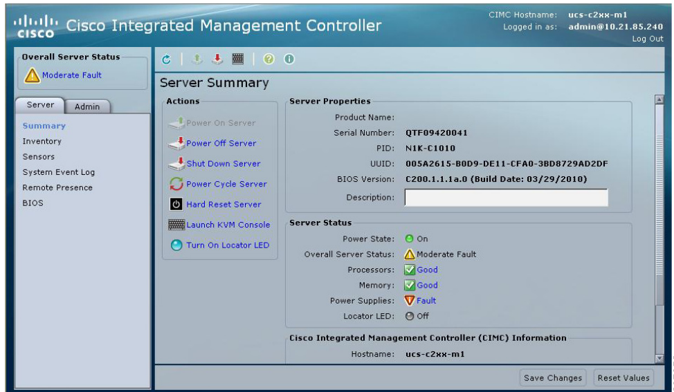
Figure 2-1 CIMC Window with Product ID (PID)

Send document comments to nexus1k-docfeedback@cisco.com .