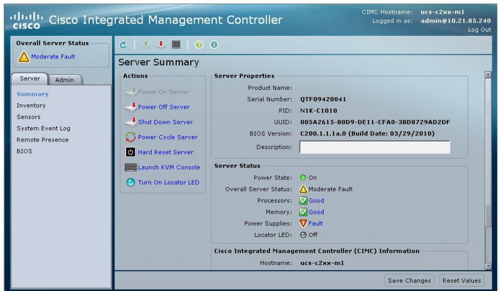
Figure 2-1 CIMC Window with Product ID (PID)

Send document comments to nexus1k-docfeedback@cisco.com .