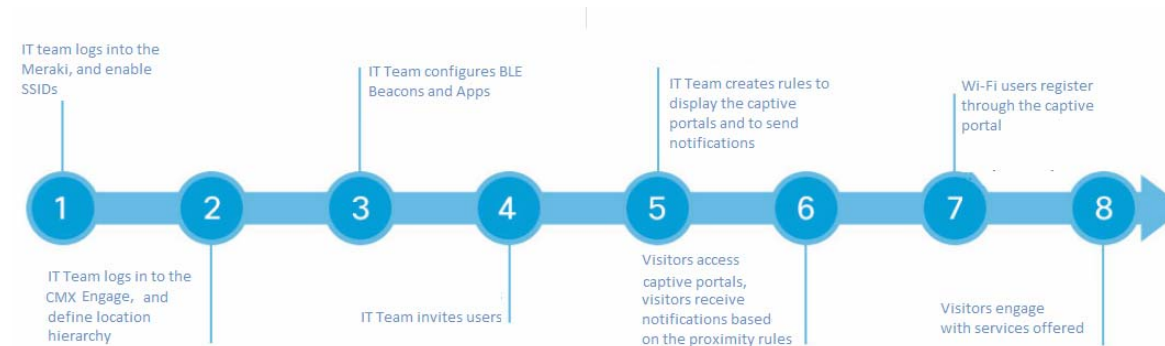
Figure 1-2 Process Flow for the WiFi Engage

The process flow for the WiFi Engage is as shown in Figure 1-2 .