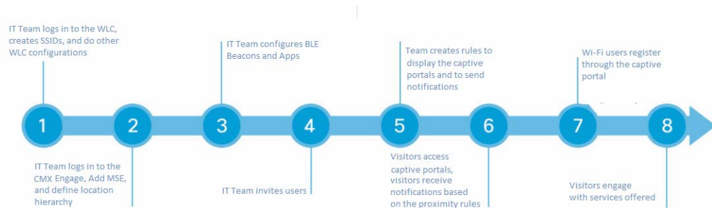
Figure 1-2 Process Flow for the WiFi Engage

The process flow for the WiFi Engage is as shown in Figure 1-2 .