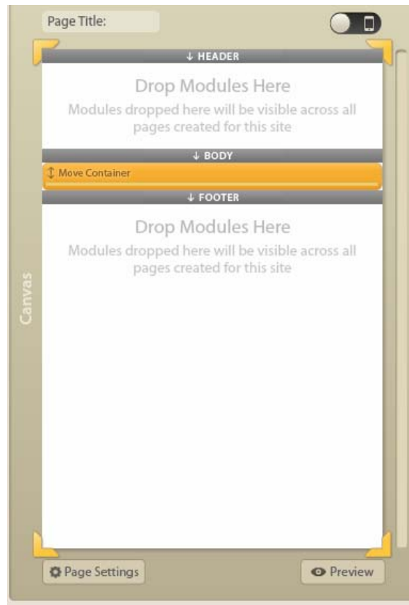
Figure 3-2 Canvas Panel

The Canvas panel has a Preview button that provides the preview of the site when modules are added into it. The Canvas has the following two types of modes: Touch Mode and Non Touch Mode.