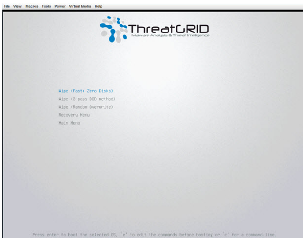
Figure 2: Wipe Options