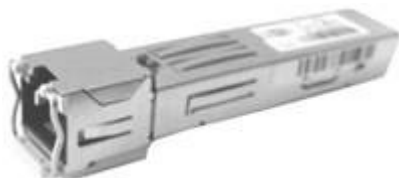
Figure 1: Cisco 1000BASE-T Copper SFP (GLC-T)

You can attach a monitor to the server, or, if Cisco Integrated Management Controller (CIMC) is configured, you can use a remote KVM (on UCS C220-M3 and C220-M4 servers).