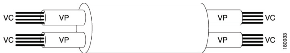
Figure 2: ATM Virtual Path and Virtual Channel Connections

Every cell header contains a VPI field and a VCI field, which explicitly associate a cell with a given virtual channel on a physical link. It is important to remember the following attributes of VPIs and VCIs: