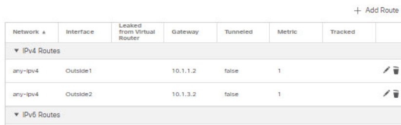
Figure 5: Configured Static Routes of ECMP Zone Interfaces