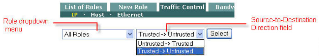
Figure 8-2 Trusted -> Untrusted Direction Field

You can similarly display the policies for a single role by choosing the role from the role dropdown menu and clicking Select .