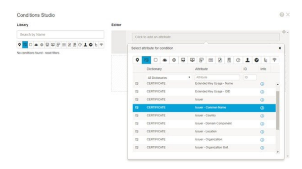
Figure 2: Conditions Studio