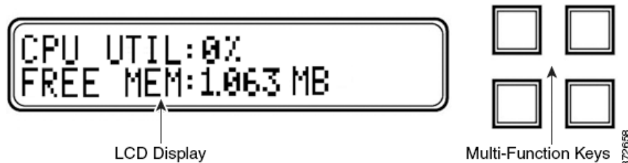
Figure 6-1 LCD Panel, Idle Display mode

In Idle Display mode, the panel alternates between displaying the CPU utilization and free memory available, and the chassis serial number. Press any key to interrupt the Idle Display mode and enter the LCD panel's main menu where you can access Network Configuration, System Status, and Information modes.