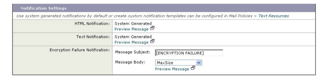
Figure 4: Encryption Failure Notification Example in an Encryption Profile

The following figure shows an encryption failure template specified in an encryption profile.