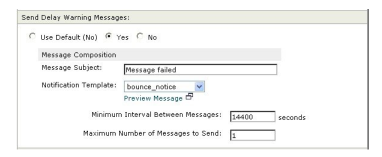
Figure 3: Bounce Notification Example in a Bounce Profile

The following figure shows a bounce notification template specified in a bounce profile.