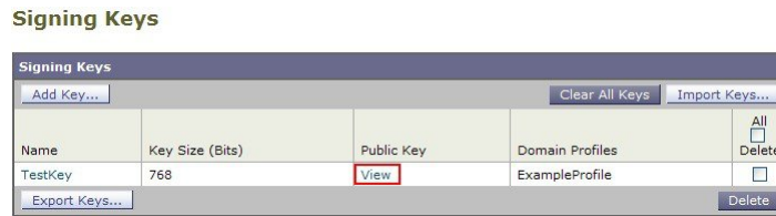
Figure 2: View Public Key Link on Signing Keys Page