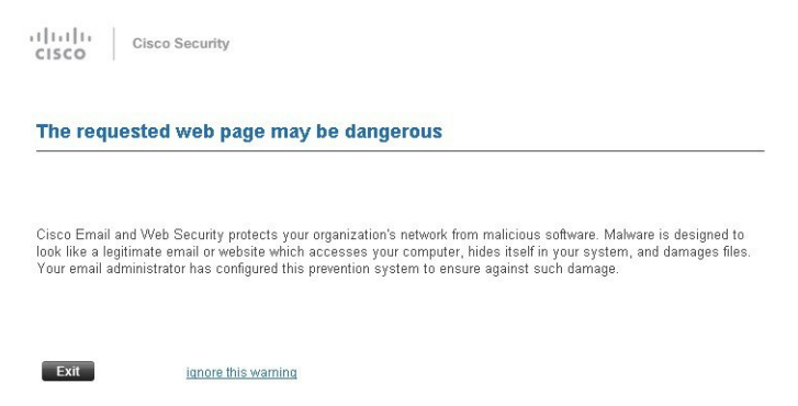
Figure 1: Cisco Security Splash Screen Warning (proxy_splash_screen)

The only way to access the Cisco web security proxy is through a rewritten URL in a message. You cannot access the proxy by typing a URL in your web browser.