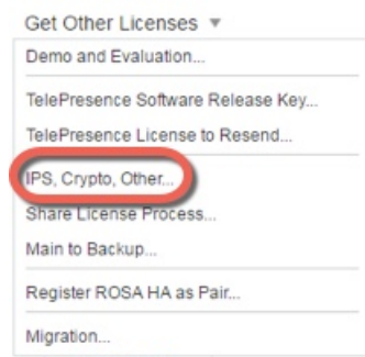
Figure 2: IPS, Crypto, Other

Step 4 In the Search by Keyword field, enter asa , and select Cisco ASA 3DES/AES License .