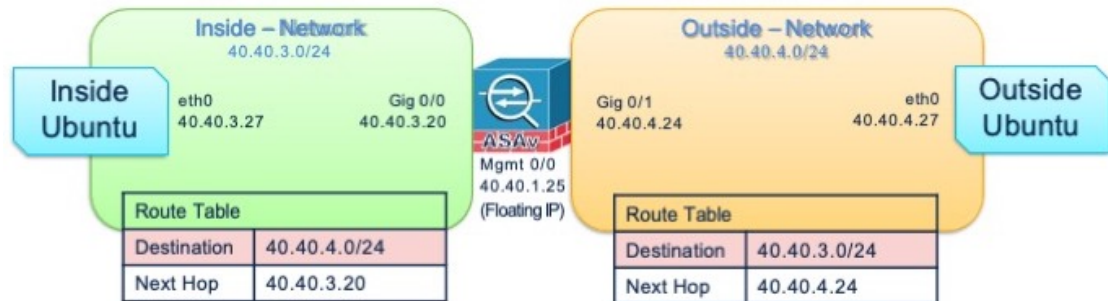
Figure 2: Sample ASAv on OpenStack Deployment