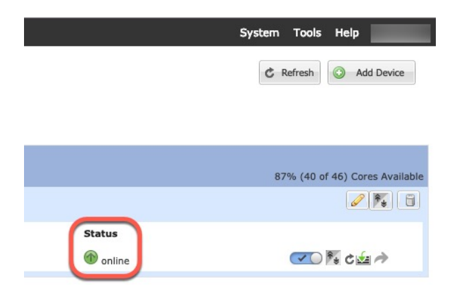
Step 11 See the ASA configuration guide to start configuring your security policy.