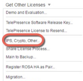
Figure 2: IPS, Crypto, Other

Step 4 In the Search by Keyword field, enter asa , and select Cisco ASA 3DES/AES License .