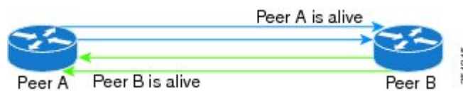
Figure 1: BFD Asynchronous Mode

Control packet failure in asynchronous mode (without echo), is detected using the values of the minimum interval ( bfd minimum-interval ) and multiplier ( bfd multiplier ) commands. For control packet failure detection, the local multiplier value is sent to the neighbor. A failure detection timer is started based on (I \times M) , where I is the negotiated interval, and M is the multiplier provided by the remote end. Whenever a valid control packet is received from the neighbor, the failure detection timer is reset. If a valid control packet is not received from the neighbor within the time period (I \times M) , then the failure detection timer is triggered, and the neighbor is declared down.