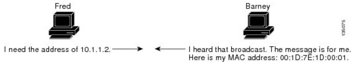
Figure 2: ARP Process

When the destination device lies on a remote network, one beyond another Layer 3 device, the process is the same except that the sending device sends an ARP request for the MAC address of the default gateway. After the address is resolved and the default gateway receives the packet, the default gateway broadcasts the destination IP address over the networks connected to it. The Layer 3 device on the destination device network uses ARP to obtain the MAC address of the destination device and delivers the packet.