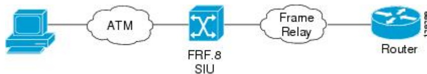
Figure 1: Frame Relay-to-ATM Interworking

You can configure ATM PVCs for IETF-compliant LLC encapsulated PPP over ATM on either point-to-point or multipoint subinterfaces. Multiple PVCs on multipoint subinterfaces significantly increase the maximum number of PPP-over-ATM sessions running on a router.