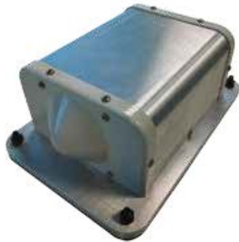
Figure 1: IW-ANT-SKS-514-Q Antenna

It is designed to survive high vibration rail installations, including roof mounting on locomotive and passenger cars.