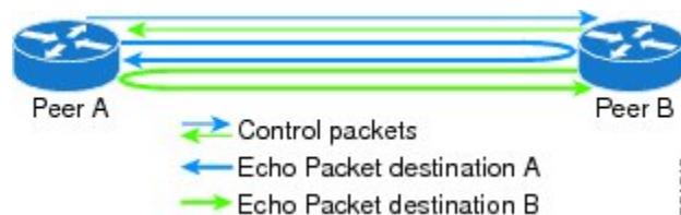
Figure 2: BFD Asynchronous Mode With Echo Packets

For more information about control and echo packet intervals in asynchronous mode, see the BFD Packet Intervals and Failure Detection .