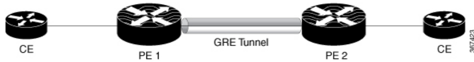
Figure 4: BFD Over GRE