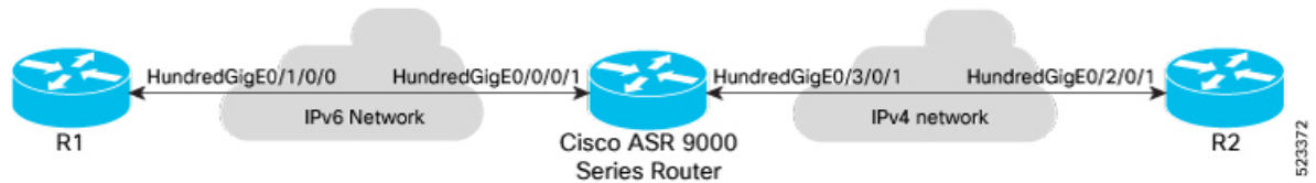
Figure 1: MAP-T L4 packets (Non-TCP/UDP/ICMP) and ICMP Error Messages Handling Topology