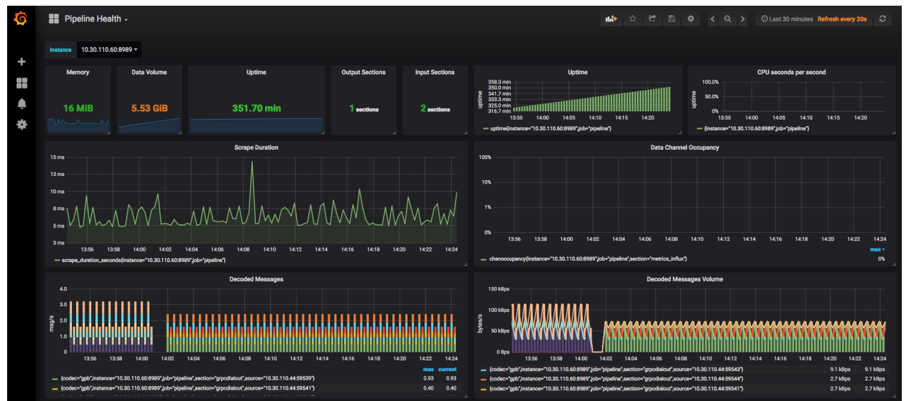
Figure 2: Visual Analysis of Network Health using Telemetry Data

Step 2 Use Grafana to create a dashboard and visualize the streamed data.