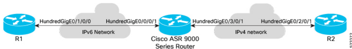
Figure 1: MAP-T L4 packets (Non-TCP/UDP/ICMP) and ICMP Error Messages Handling Topology