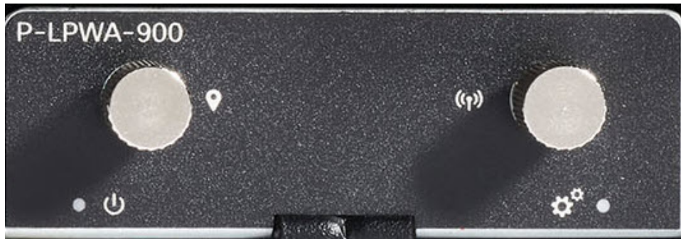
Figure 1: P-LPWA-900 LoRaWAN Pluggable Interface Module

The following figure provides details for the Cisco LoRaWAN pluggable module: