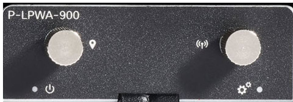
Figure 5: P-LPWA-xxx LEDs

There are two LEDs on the front the PIM module. The LED on the left is the Power LED, and the LED on the right is the Status LED.