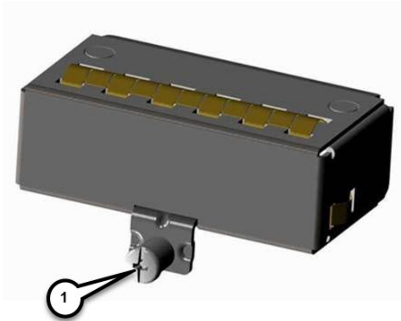
Figure 3: Latch Lock Screw

Step 2 Slide the blank plate out of the device.