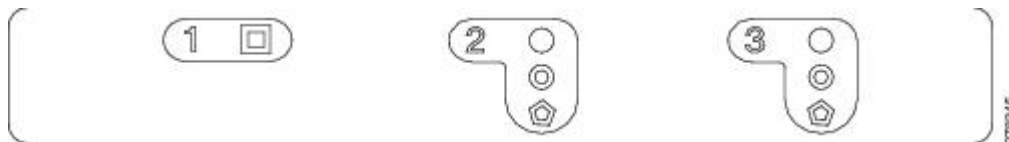
Figure 1: Slot Symbols

The following table shows the slot and card symbol definitions.