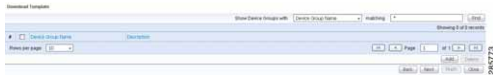
Figure 13-5 Select Download Template