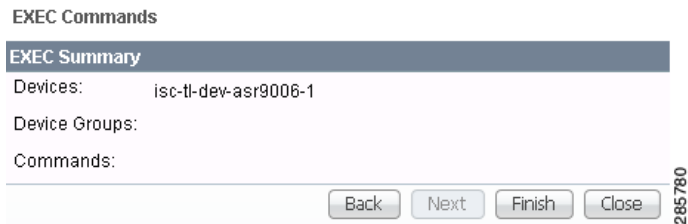
Figure 13-12 EXEC Commands Summary