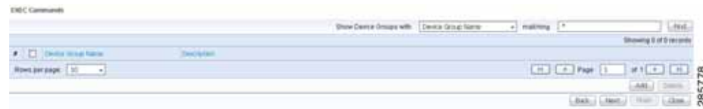
Figure 13-10 Device Group Selection