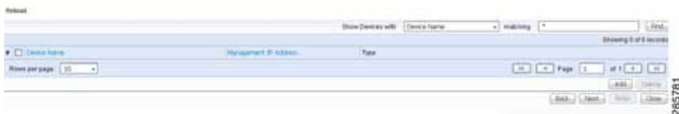
Figure 13-13 Device Console—Reload: Select Devices

A window appears as shown in Figure 13-13 .