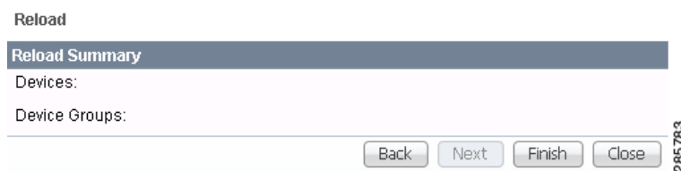
Figure 13-14 Reload Summary