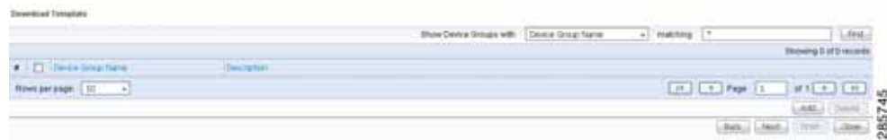
Figure 13-4 Device Group Selection

Step 13 From the resulting window, check the check box(es) for each device group you want to select. Then click Select .