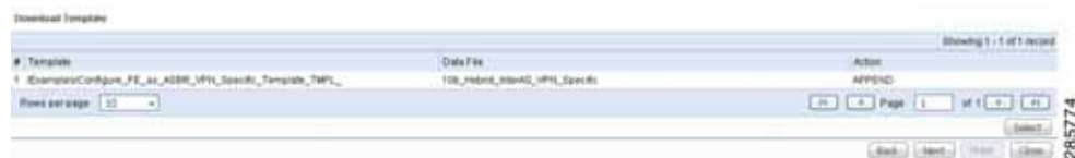
Figure 13-6 Add/Remove Templates

When you click Add you get a Template Datafile Chooser window with the template choices in the tree. Click + to open the folders and subfolders in the tree, until you get the property you want to choose. Click on that property and it is added to your list. Repeat this until all the templates you want are in your list. In each added property, you can click View and you receive the configlet for that data file. To return, click OK . In Figure 13-6 , check the check box(es) for the template(s) you want. In each template row, click the Action drop-down list and choose APPEND or PREPEND to add information after or before, respectively; check or uncheck the Active check box; and then click OK .