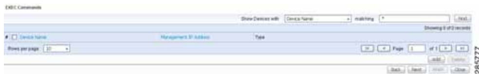
Figure 13-9 Device Console—EXEC Commands: Select Devices

A window appears as shown in Figure 13-9 .