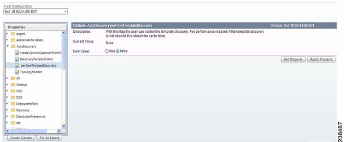
Figure 2-2 Properties Detail Example